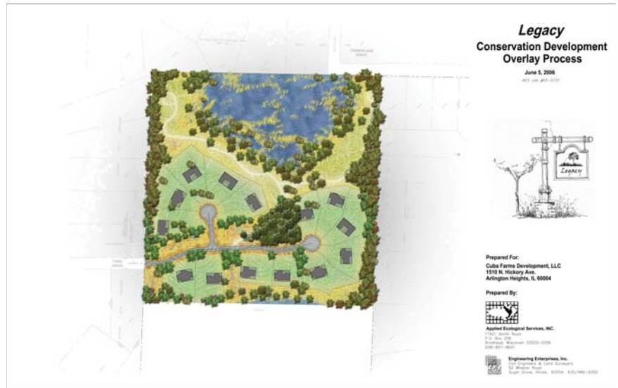
A rendering of the Legacy Conservation Development

Legacy is a high-end, luxury conservation development that Applied Ecological Services, Inc. (AES) was hired to design. AES used a conservation development approach with the key goal being to protect the high-quality wetlands on site. AES designed with nature in mind, as always, by protecting the natural elements of the area while enhancing and creating new nature during the process. All of the lots in the development abut open space, which helps home owners to get direct access to open space. AES also designed meandering trail systems that interconnect throughout the development. The trail systems offer home owners an opportunity to take advantage of the open space provided on the site, which includes wooded uplands, wildlife habitat, community gathering areas, and much more.